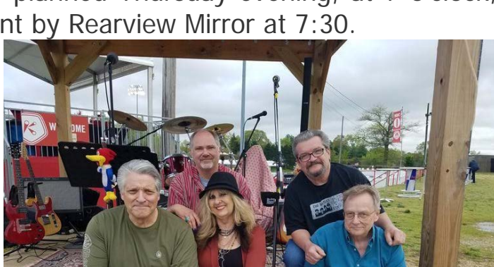
Rearview Mirror will entertain with rock and roll as well as blues music Thursday evening, July 12, 7:30, at the Richmond Free Fair, Richmond, Kansas.