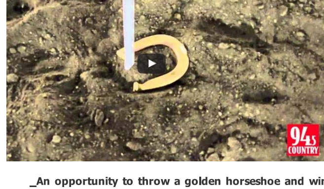
An opportunity to throw a golden horseshoe and win $10,000 if it's a ringer has again been planned as a special promotion incentive for The Topeka Rodeo, August 19-20, at the North Topeka Saddle Club Arena.